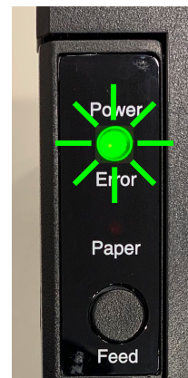
Flashing GREEN mean offline

NOTE: To perform a printer Reset, turn the printer OFF using the power switch on the front of the printer. Press and hold the Feed button while turning the printer back ON.