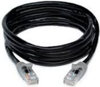
Ethernet Cable (1)