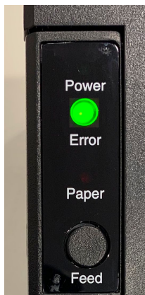
Solid GREEN mean online

Step 4: Once the green 'Power' light turns solid, the printer is Online (this may take up to 2 minutes). A blinking green light means the Printer is not connected or lost connectivity, please check that internet service is available and all wire and power connections are plugged in securely.