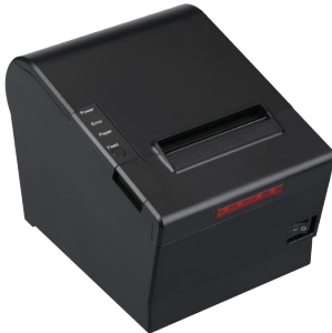
Labrador Smart Printer