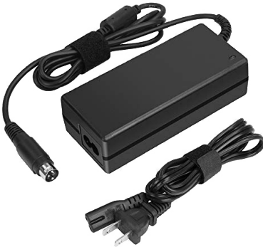
Power Supply (1)