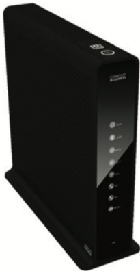
Your Existing Internet Service Router